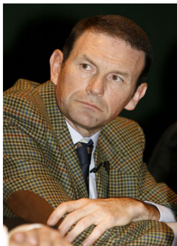
Juan Jose Ibarretxe